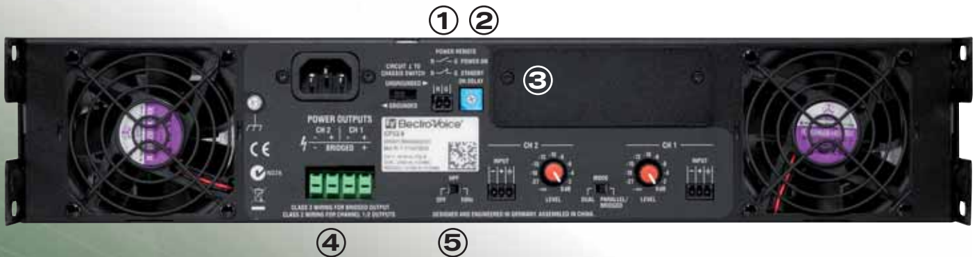
CPS2.x rear view

Like the CPS multi-channel amplifiers, CPS two-channel models also include a module slot for the RCM-810 remote-control module, enabling networking services for remote system diagnostics and control via IRIS-Net software.