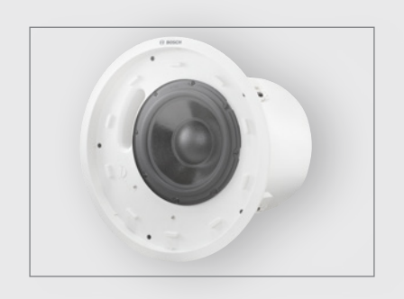
Ceiling sub grille off