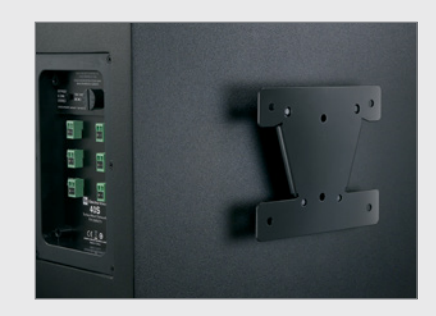
Surface sub wall-bracket mount