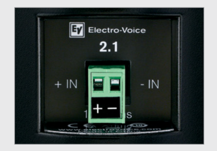
Surface satellite input panel