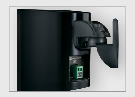
Surface satellite wall-bracket arm