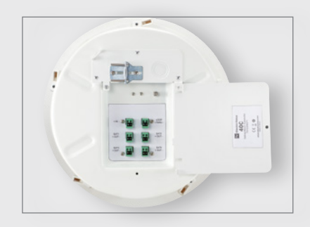
Ceiling sub input panel